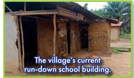
The village's current run-down school building.

With your help, our children worldwide can focus on learning and thriving. Mark your gift “Back to School” to help with this important need.