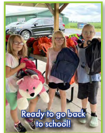
Ready to go back to school!

Our favorite part of the day? Seeing the excitement on a young girl's face when she received her very first Bible.