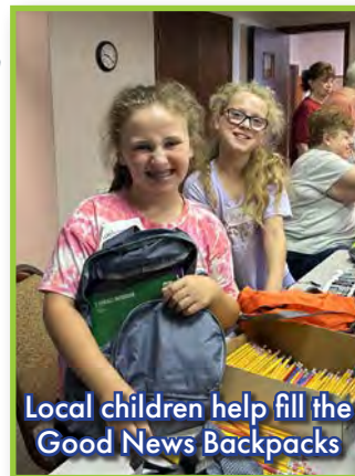
Local children help fill the Good News Backpacks

In those brief moments of connection, we were reminded that our mission is about so much more than meeting material needs. It's about showing up for people when they need it most, offering a hand to hold, a prayer to share, and, most importantly, bringing the message of true Hope that can light their way.