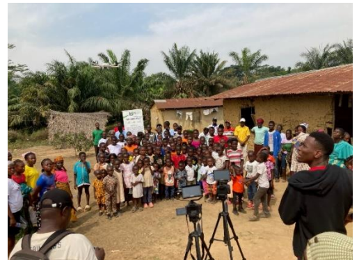
Gbonota School Dedication

If you would like to give towards this school building, please send a check with the memo "Liberia school" or visit our website to give a gift online: https://bringingchildrenhope.org/project/vbs-2025